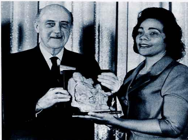
Mrs. Coretta Scott King accepts the PPFA Margaret Sanger Award from Cass Canfield, Chairman of the Executive Committee of the PPFA-World Population Emergency Campaign.

Dr. King did not deliver the acceptance speech. Planned Parenthood used Mrs. King for their purposes.