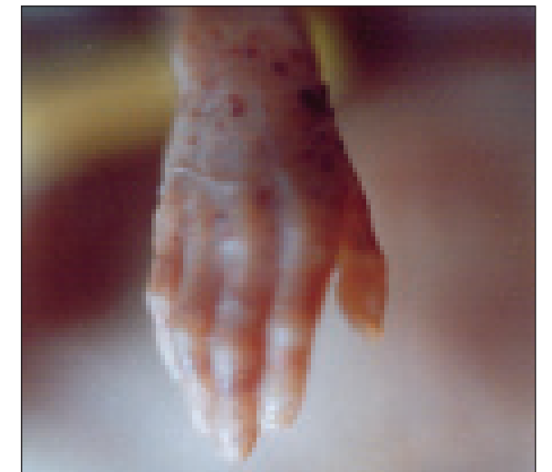
The hand of an aborted baby found in a dumpster.

Therefore, as Roe vs. Wade observances occur this month, and as the message of life is proclaimed anew, let nobody hesitate to give to the abortion tragedy the "urgent attention and priority" ( US bishops ) that it deserves, and let nobody invoke Cardinal Bernardin as a reason for their hesitation.