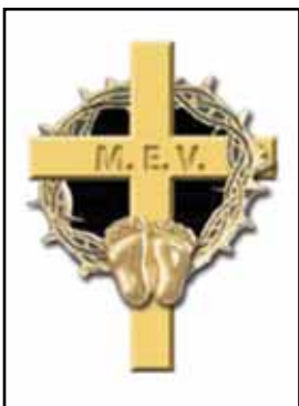
The emblem for the Missionaries of the Gospel of Life