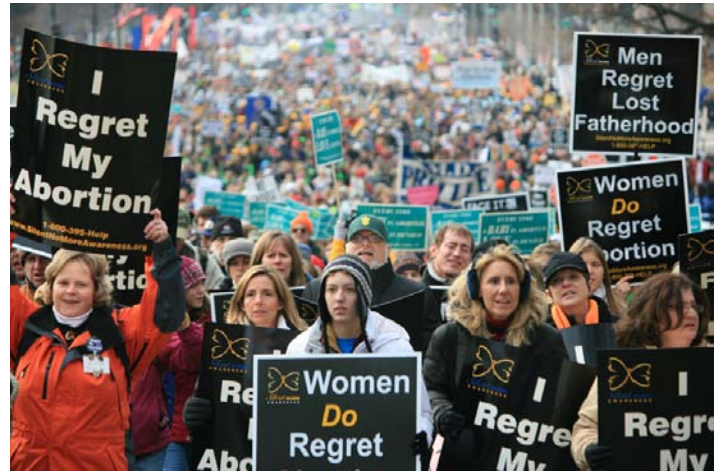
The Silent No More Awareness Campaign witnesses at the March each year.

hears from at least one woman who has had an abortion and now regrets it. This is arranged through our Silent No More Awareness Campaign ( SilentNoMore.com ), a joint project of Priests for Life and Anglicans for Life. Moreover, women and men alike who have lost children to abortion and regret it walk in the front section of the March holding their signs saying, "I Regret My Abortion" and "I Regret Lost Fatherhood." Then, when the March arrives at the Supreme Court, these men and women begin sharing their testimonies publicly in front of the steps of the court, and the marchers stop for a while to listen to and learn from them, and to pray with them. You can see videos of past gatherings at SilentNoMore.com , and you can also indicate on that website if you or someone you know feels called to share testimony.