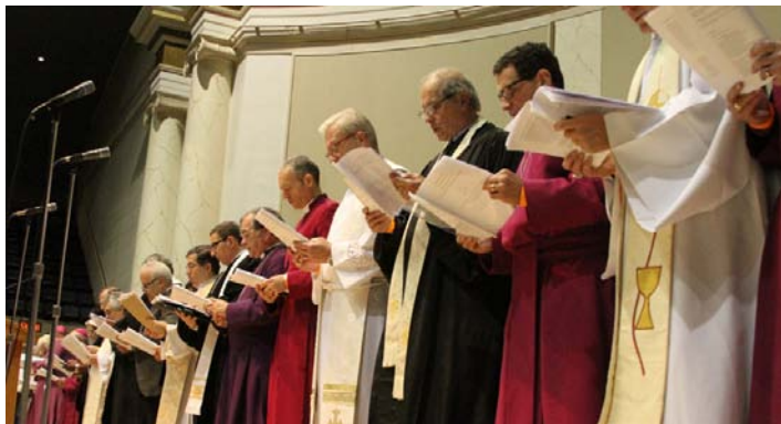
The National Memorial for the Pre-Born and their Mothers and Fathers

Then, as part of the March for Life Rally, the crowd always