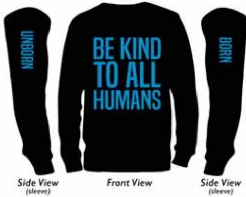
"Be Kind To All Humans Born/Unborn" T-shirt.

Ultra cotton poly blend long sleeve t-shirt in black with sapphire lettering.