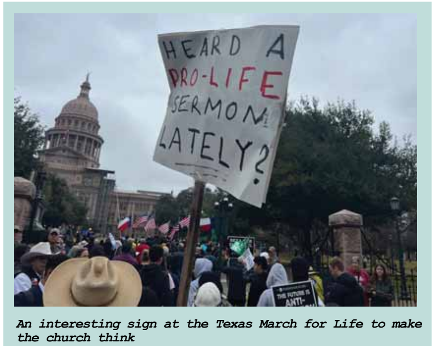
An interesting sign at the Texas March for Life to make the church think

It is one thing to know that the unborn in America have more protection than ever before. But on Saturday, January 28th, I stood with hundreds of Texans in front of the state Capitol Building in Austin. We had just conducted the March for Life and I was one of the speakers for the Texas Right to Life Conference.