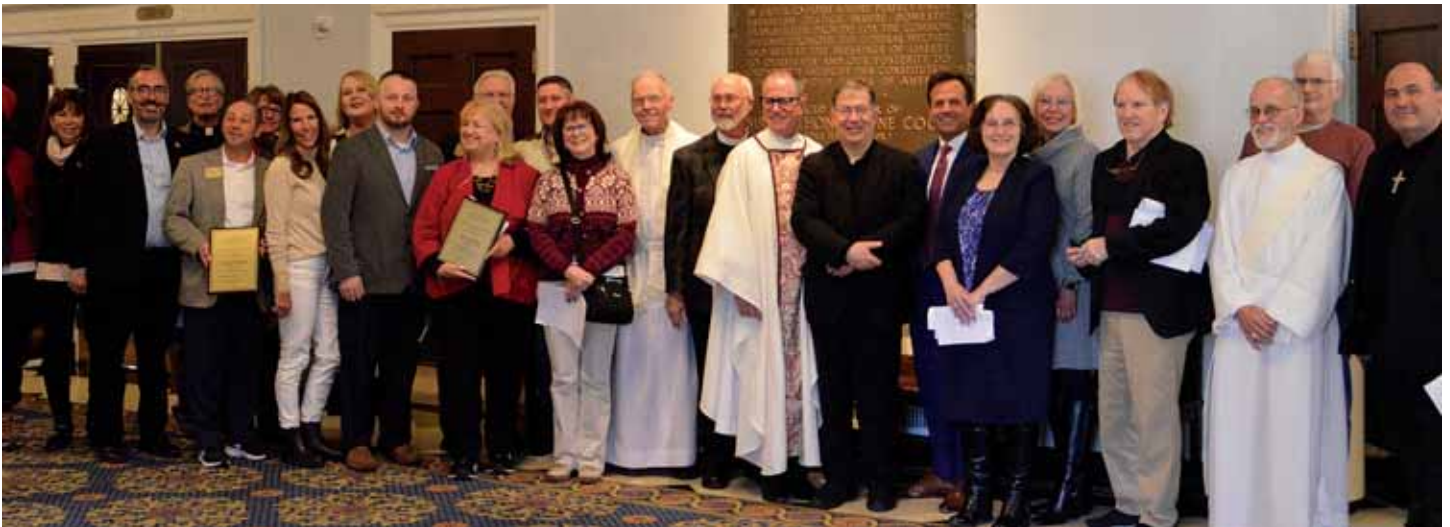
Clergy, pro-life leaders and state leaders helped lead the National Prayer Service we organized in Washington, DC on January 24.