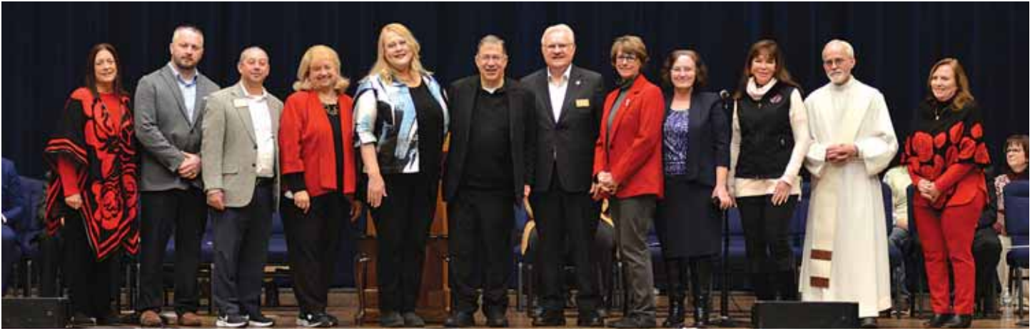
Some of the state pro-life leaders who fought the pro-abortion ballot amendments on the stage at the National Prayer Service in Washington, DC on January 24.