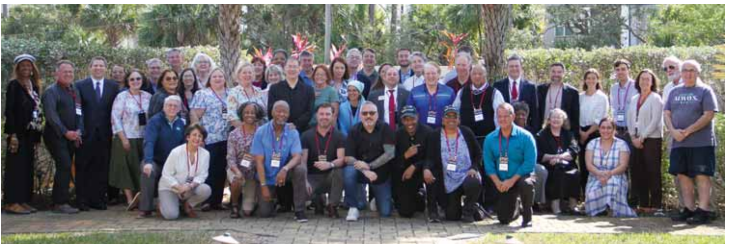
Some 50 pro-life leaders gathered at the Priests for Life Titusville, FL headquarters in February for strategy meetings and fellowship.