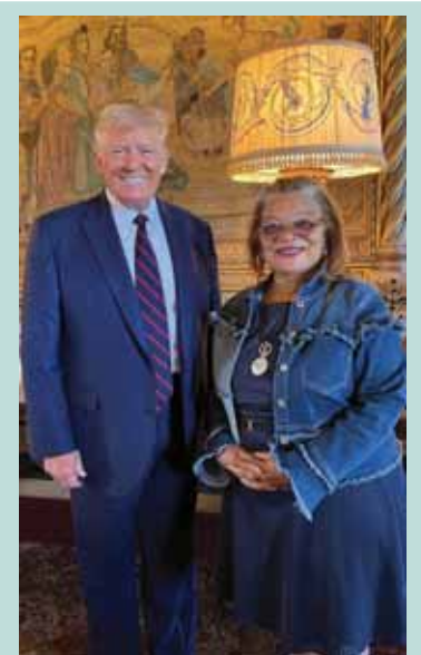
Evangelist Alveda King, fulltime Pastoral Associate of Priests for Life, visited President Trump in May in Mar-a-Lago. She states "So honored to visit with President Trump... Grateful for his unwavering commitment to end abortion in our lifetime!"

Father, Your care extends to every human person, No matter what afflictions they suffer, And you uphold the dignity of every human life, Regardless of the false ways that the world may calculate its value. You gave us St. Margaret of Castello as a sign and a challenge. You permitted your glory to shine through her human weakness, And called those around her to love her Despite her physical limitations. Forgive us when we fail to defend the least among us. Through the intercession of St. Margaret, Give us grace to speak up for the outcast and to welcome those who are rejected. When this brief life is over, Grant that we who have welcomed all our brothers and sisters, May be welcomed by you into the life that never ends. We pray through Christ our Lord. Amen. (See ProLifePrayers.com.)