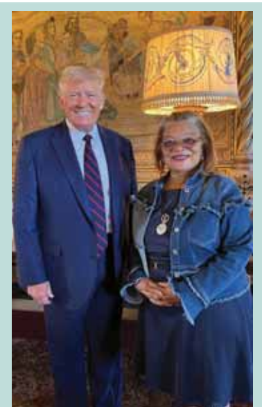
Evangelist Alveda King, fulltime Pastoral Associate of Priests for Life, visited President Trump in May in Mar-a-Lago. She states "So honored to visit with President Trump... Grateful for his unwavering commitment to end abortion in our lifetime!"