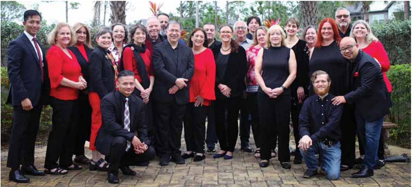
The 2024 Priests for Life photo with much of our staff (but not all) from our December gathering.