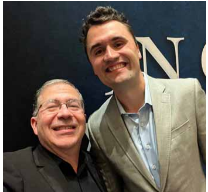
On December 13-14, Frank Pavone spoke to the National Association of Christian Lawmakers national conference in Scottsdale, AZ. Frank is an advisor for the group. He is pictured here with Charlie Kirk who also spoke at the banquet. When they greeted each other just before this photo, they both exclaimed in a celebratory way, "We did it!" The whole night was a celebration of the election victories and a commitment to build on them.