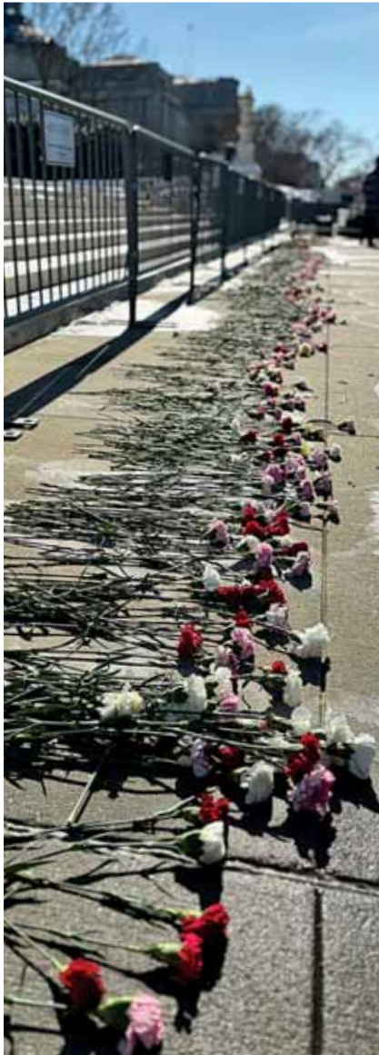
On January 22, flowers were placed in front of the Supreme Court representing the victims of Roe v. Wade.

Our votes matter! What a painful change to go from being a pro-life state to being one where human life is disregarded. I will do my part to bring change and defend the preborn and their mothers. I will always vote pro-life and will also work to help cultivate future leaders and politicians who will use the power of their offices to be the voice for the voiceless.