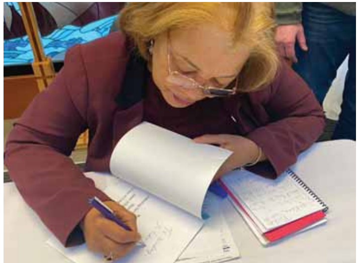
Evangelist Alveda King, founder of our Civil Rights for the Unborn outreach, traveled to Spokane, WA on behalf of Priests for Life to be the keynote speaker at the annual Lincoln Day dinner sponsored by the Spokane County Republican Central Committee. She met with community leaders and citizens at a roundtable event and spoke on pro-life issues at St. Mary’s Catholic Church in Spokane.