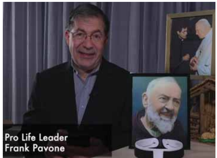
Pro Life Leader Frank Pavone