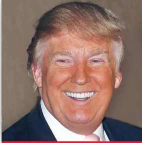
TRUMP PENCE REPUBLICAN